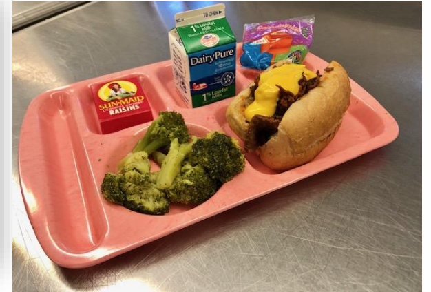
Philly Cheese Steak Sub