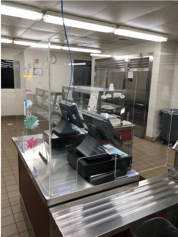
Plexiglass barriers for both staff and student protection.