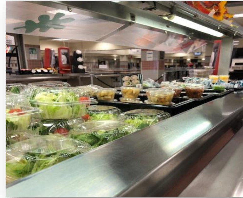
Offering single serve items on the salad bar.