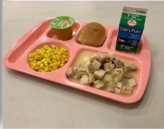
Thanksgiving Turkey Meal