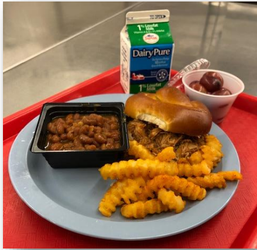
Pulled BBQ Pork Sandwich