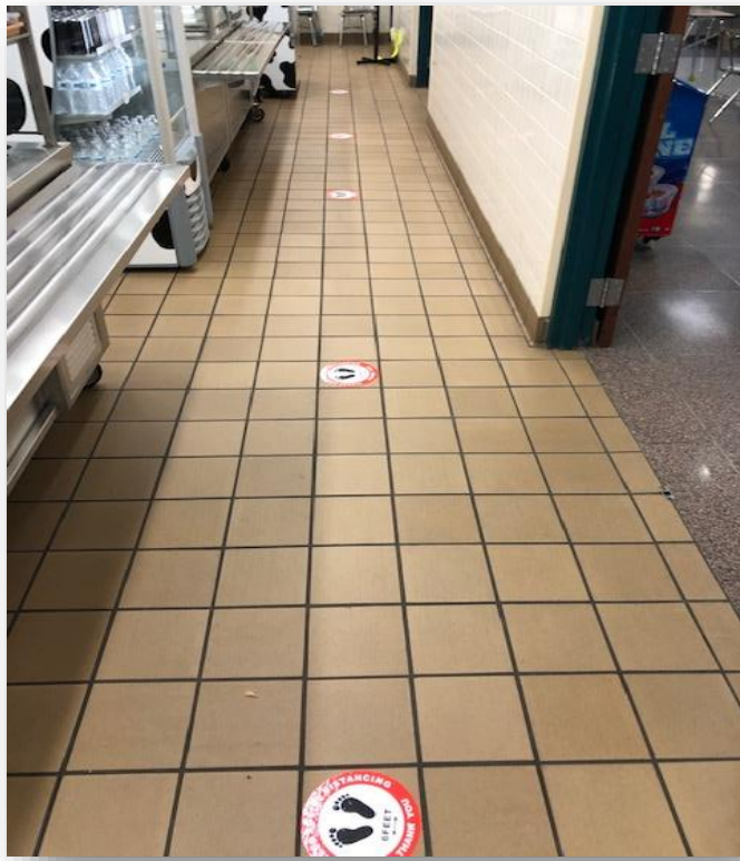
Ensuring we are practicing social distancing in our cafeterias.