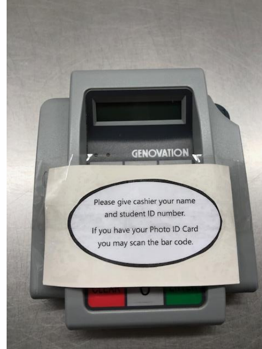
Utilizing the bar code system on our pin pads.