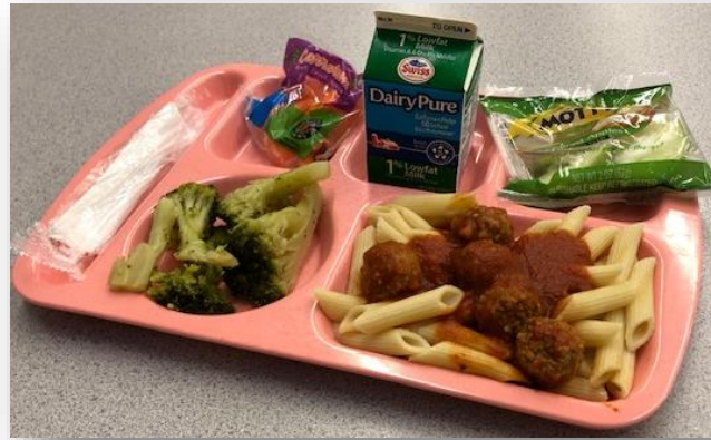
Elementary Pasta Day